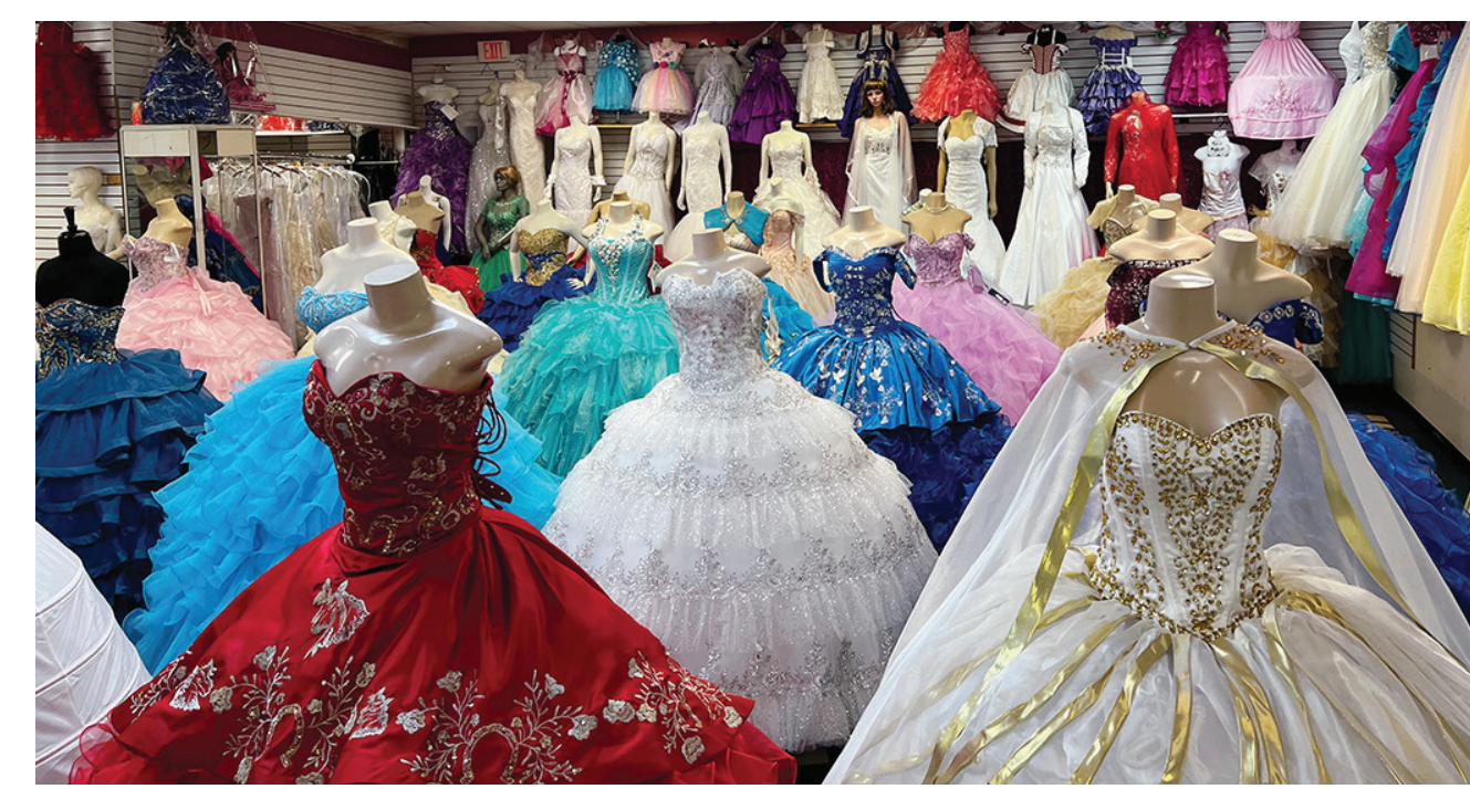
La Estrellita Fashion sells dresses for quinceañera and other special occasions.

Europa Groceries carries a variety of products