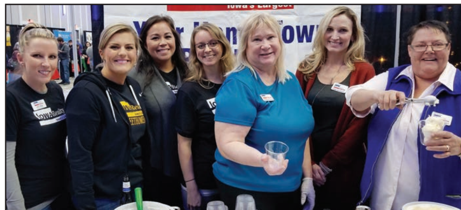
The Altoona Iowa Realty Team at Taste of Altoona, which was hosted by the Altoona Chamber of Commerce at Prairie Meadows Event Center on Oct. 15.