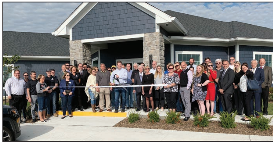
The Grimes Chamber of Commerce celebrated a ribbon cutting at Ascend At Heritage held on Sept. 26.