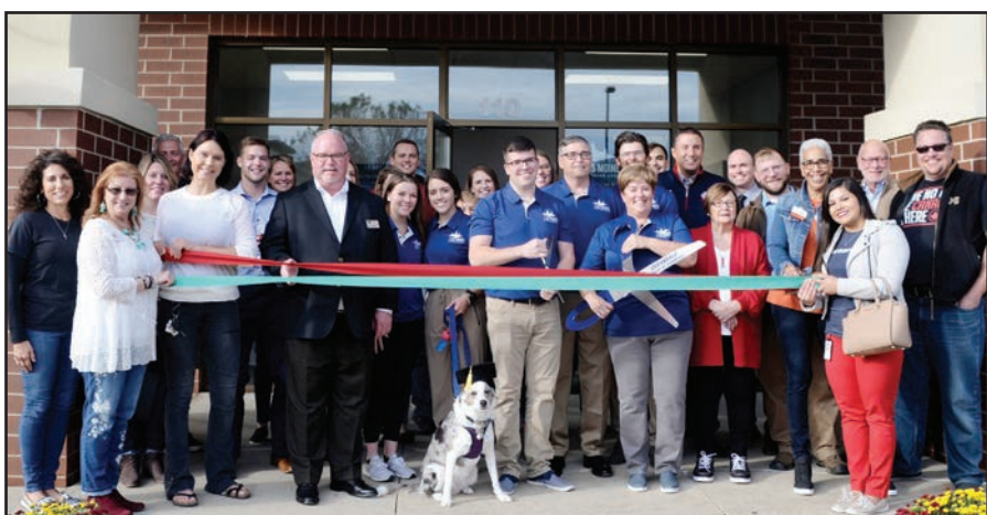
The Clive Chamber of Commerce held a ribbon cutting for the grand opening of Des Moines Learning Center, 12871 University Ave., Suite 110, Clive, on Oct. 4.