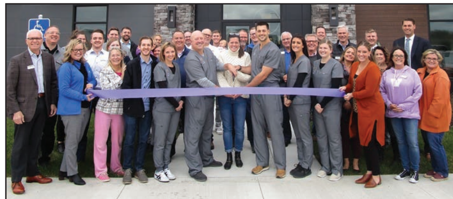
The Waukee Chamber held a ribbon cutting for Lush Family Dental, 2505 S.E. Encompass Drive, Waukee, on Oct. 11.