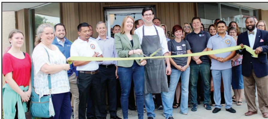
The Windsor Heights Chamber of Commerce held a ribbon cutting for R I Restaurant on Sept. 27.